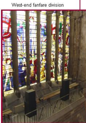
West-end fanfare division